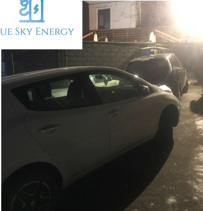
Queue to Charge