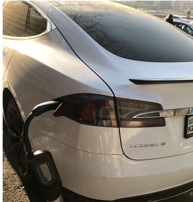
CHAdeMo to Tesla Adapter