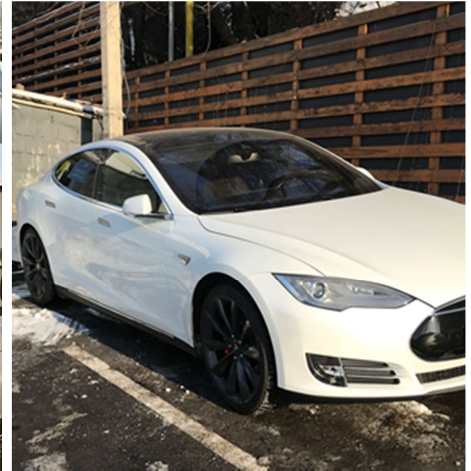
Yes, We Charge US Tesla